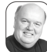
GORD GRAY Public Relations