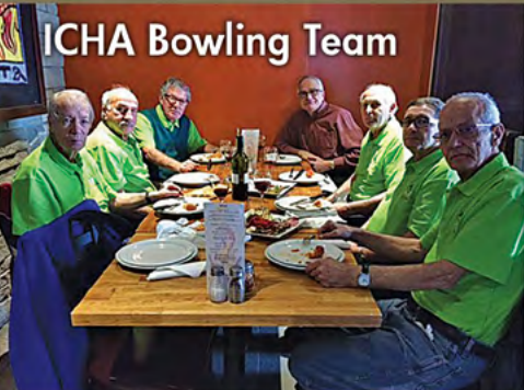
ICHA Bowling Team

Windsor SPITFIRE Hockey Players visit the ICHA FLOOR HOCKEY TEAM @ The Novelletto-Rosati Sports Complex