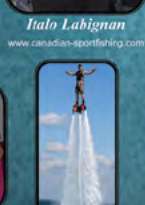
Windsor Flyboard www.windsorflyboard.com